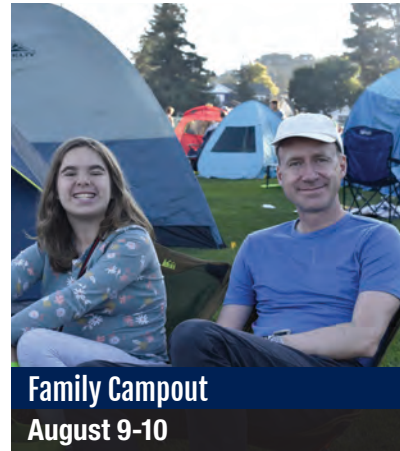
Family Campout August 9-10