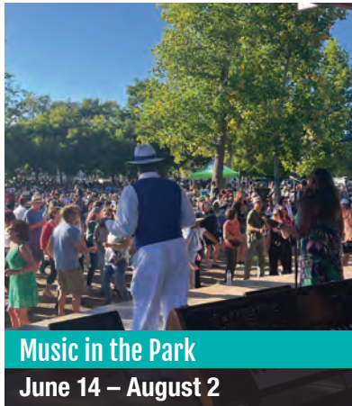
Music in the Park June 14 – August 2