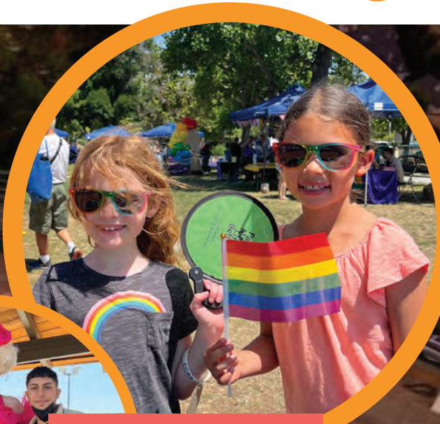
Pride in the Park