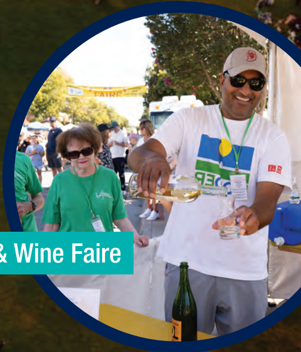
Art & Wine Faire