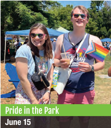
Pride in the Park June 15