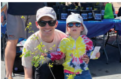
Day of Service – Earth Day

Teen Wellness Retreat 9:00 a.m. – 2:00 p.m. cityofsancarlos.org/scyc